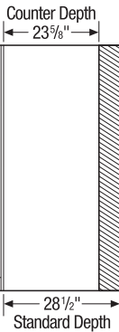
Standard Refrigerator Depth vs. Counter Depth