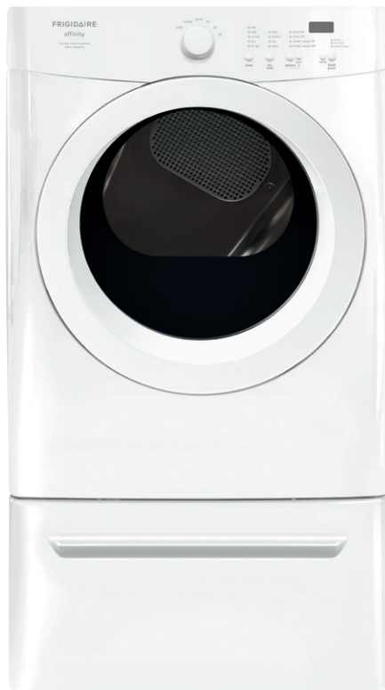
Optional SpaceWise® Pedestal Drawer Shown