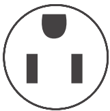
Plug Type (NEMA) 5-15P

1 Warranty 5 year sealed system/1 year full parts and labor.