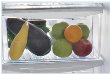
Largest Crisper Drawers 1 Store more in our crisper drawers.