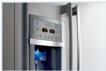
Real Stainless Steel Real stainless steel with a protective coating that reduces fingerprints and smudges so it's easy to clean.