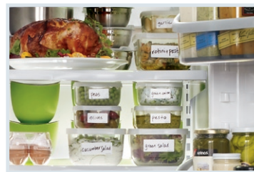
SpaceWise™ Organization System Our SpaceWise™ Organization system makes it easy to keep food organized and easy to find when you need it.