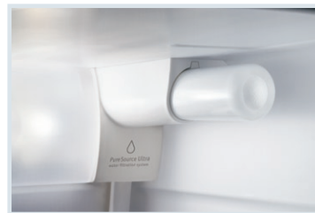
Best-in-Class Ice & Water Filtration 2 PureSource Ultra™ Water Filtration offers best-in-class water filtration so you get cleaner, better-tasting water at your fingertips.